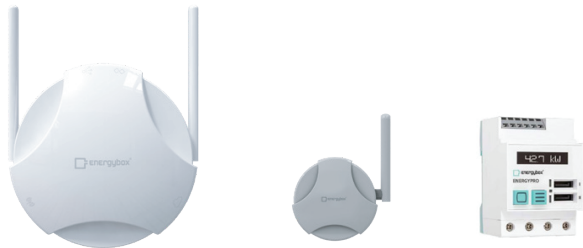
Wireless Sensors & Gateways